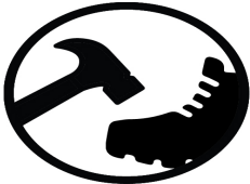
Steel / Composite Toe Cap

Pictures are for illustration purpose only, actual may vary. Specifications are subjected to change without prior notice.