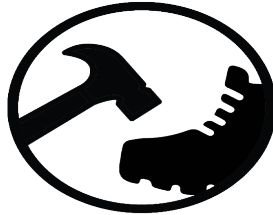
Steel / Composite Toe Cap