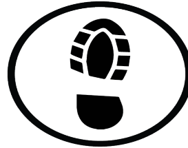
Anti - Slip / Dual Density